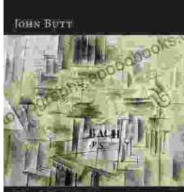
Bach's Dialogue with Modernity Perspectives on the Possions