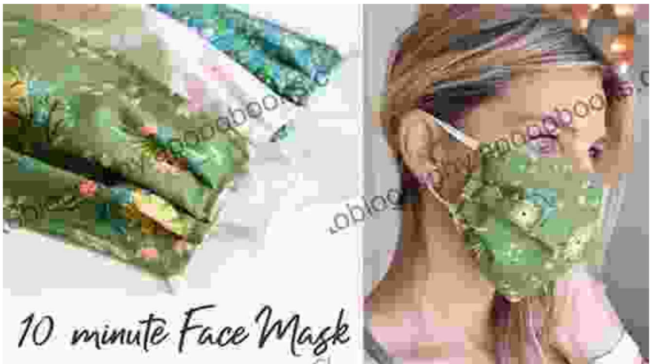
Basic Face Mask with Adjustable Ear Loops

Here's a glimpse of some of the easy sewing patterns you'll find in the book: