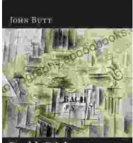
Bach's Dialogue with Modernity Perspectives on the Possion