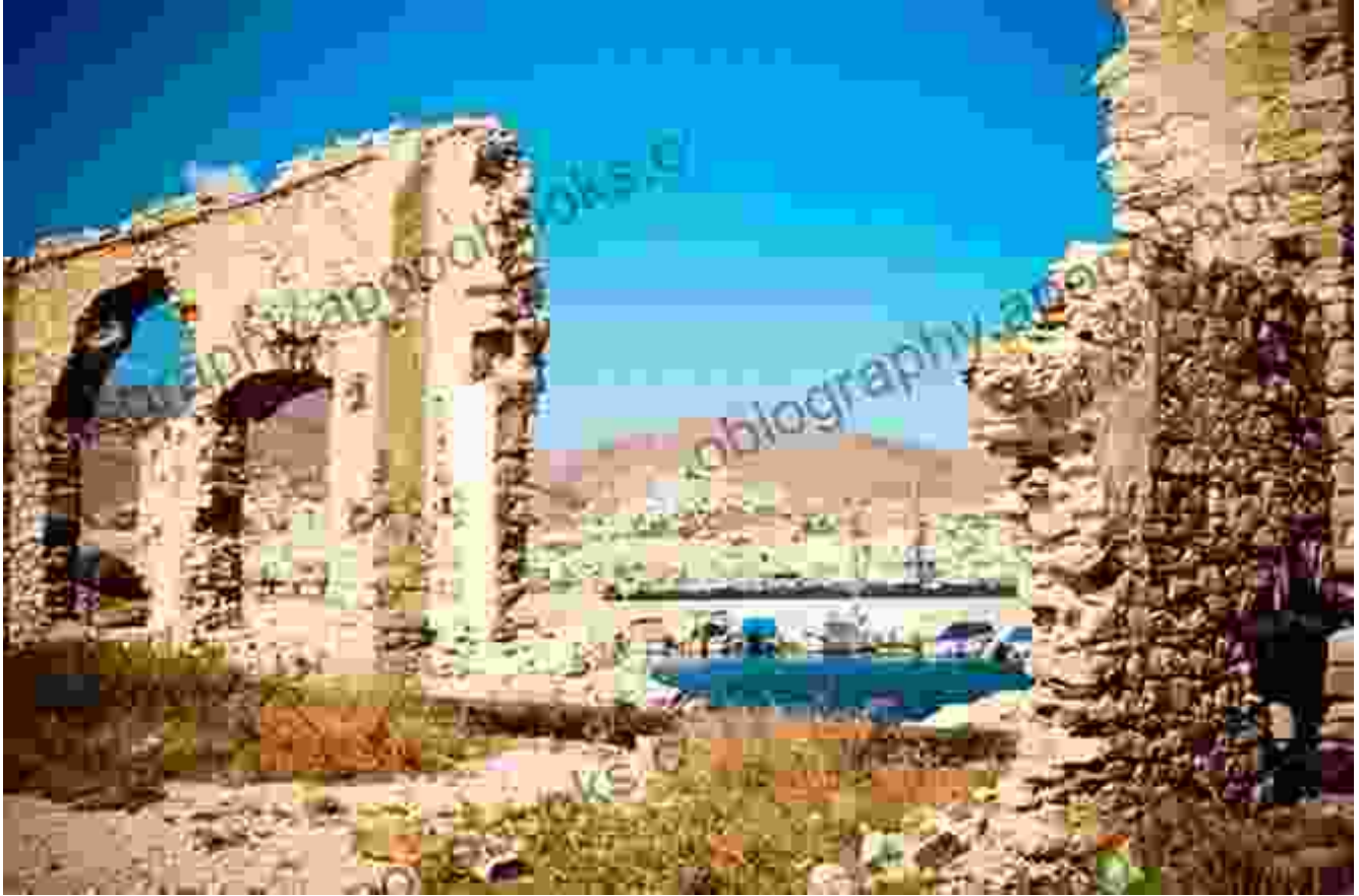
Syros, an island in the Cyclades archipelago